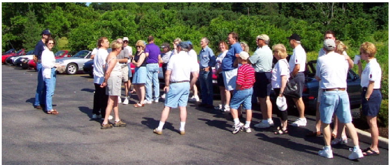
The Rally Masters prepare the drivers for a nice, easy drive through Eastern Indiana. A great day for a rally!