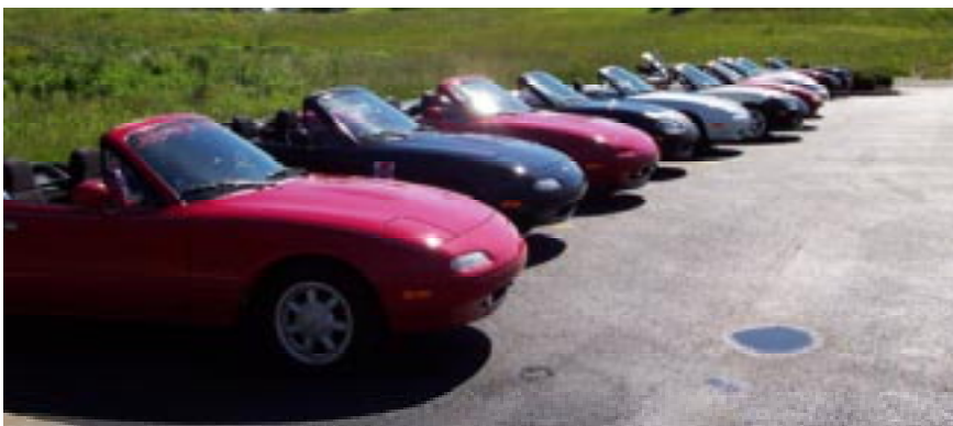
Sunshine, Miatas and great roads..does it get any better than this?