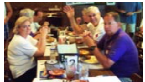
"We had a fun rally and good food!"