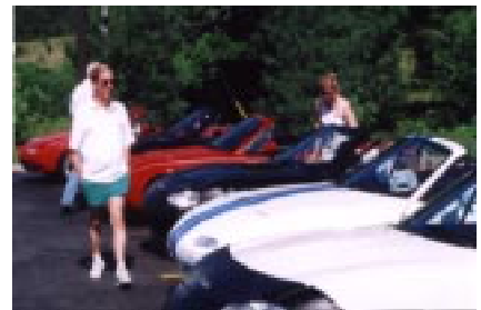
Always check out the competition.

Road Rallies can be fun for the driver and co-pilot as long as they maintain the proper competitive perspective. This list of helpful rallying tips should encourage novice competitors to come out to the next event. Try them out and let me know how they work for you. I’ll see you all at the next event — I’ll be in the blue Miata right behind you!