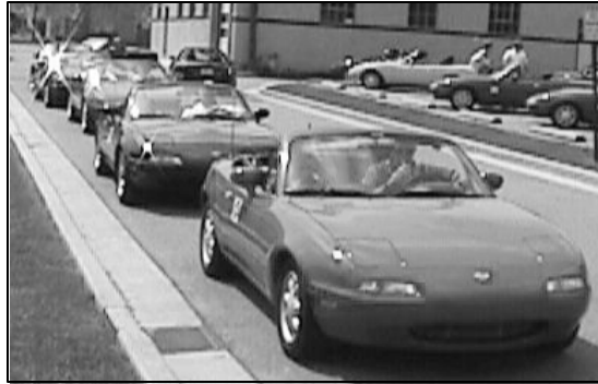
The lineup at the start of the 2001 PTBR

The rally finished in Lafayette at Logan’s Road house, where answer sheets were scored, food consumed, and the rally rerun from several different perspectives. There was a three way tie for third place, and additional questions were posed. All the teams answered the questions correctly, so third