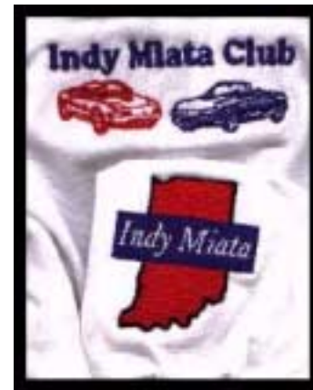
Logos for Polo Shirt Cars on left front Club logo on sleeve

We have some shirts, both T's and Polos remaining for sale. For the next three months, we'll be selling these for a discounted price. Check our web site at http://members.aol.com/indymiata/index.htm for color photos of the shirts. (merchandise page) The T shirts are now just $8.00! And the Polos are just $15.00 each.