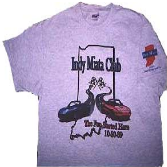
10th Anniversary T-shirt