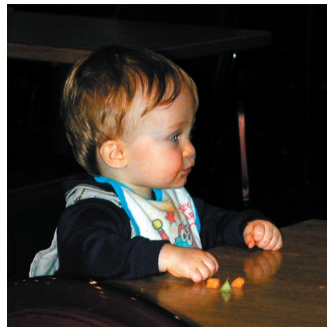
A future Miata driver minds his peas and carrots at the November dinner and meeting.