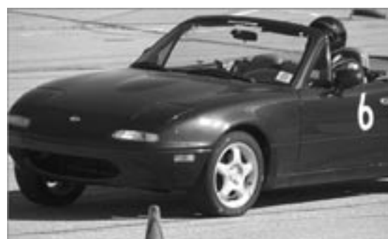
Matt Reeck looks ahead to the next portion of the course during an autocross run at the old Bush Stadium.