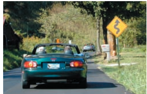
A sign to warm any Miata owner's heart. Curves ahead!

Chuck hinted at big things for next year's F1 event, so stay tuned!