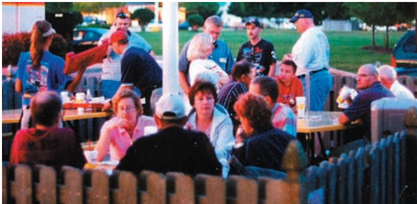
Brickyard Mingle

More photos of club events can be found at www,indymiata.org .