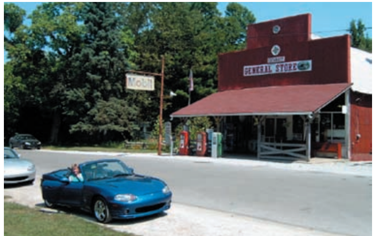
The Cataract General Store was a stop for some Miatas during the Late Summer Mardi Gras Rally.