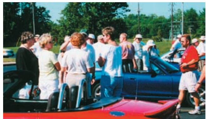
Club members wait for the driver's meeting to start.

Ralliers lineup to wait for the start of the rally.