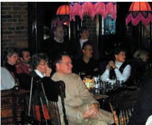
Everyone watches as gifts are opened, seeing what they want to steal when it's their turn!