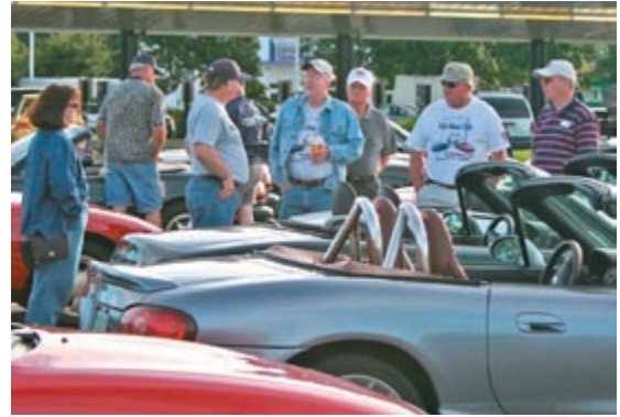
So many cars, so much conversation about them.

Ending back up at the zoo after a 30 minute tour, we all mingled and watched the sun set over a bevy of a few dozen roadsters. In all, it was much fun and I can hardly wait to do it again next year!