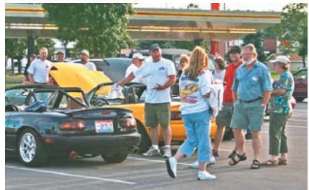
(R) Our Ohio guests show off their cars.