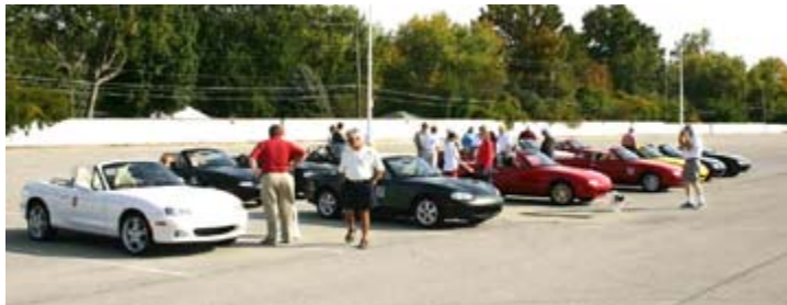
Above: Getting ready for the drivers meeting. Below: Getting ready to eat!