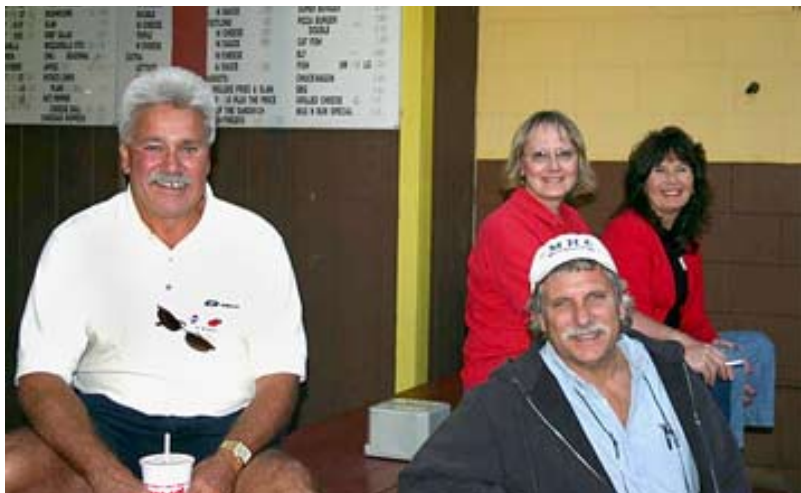
Arriving at the Mug 'n Bun and finding a place to park.