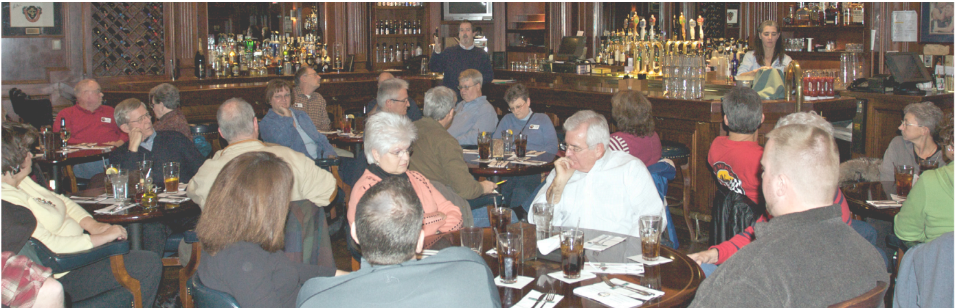
Lunch with the President Elect at Daddy Jacks!

This is the Web edition of the Open Road. With some minor modifications, this is how you'll receive the Open Road in the coming months.