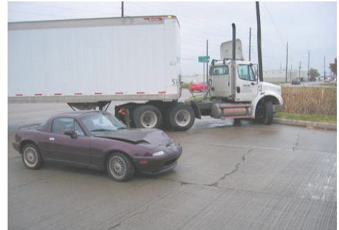
A sad picture. Semi = 1, 1995 M-Edition = 0.