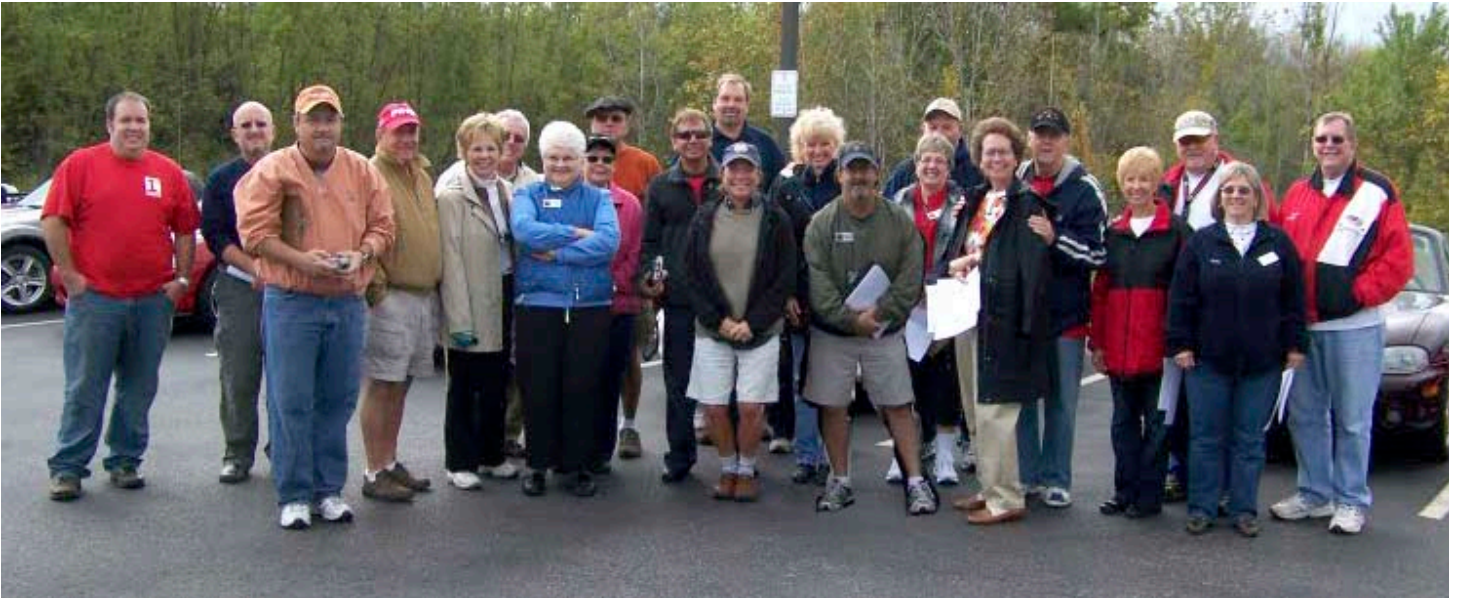
Group shot of the Marietta Madness participants.

Final Notice! You must RSVP for the Holiday party before November 15!