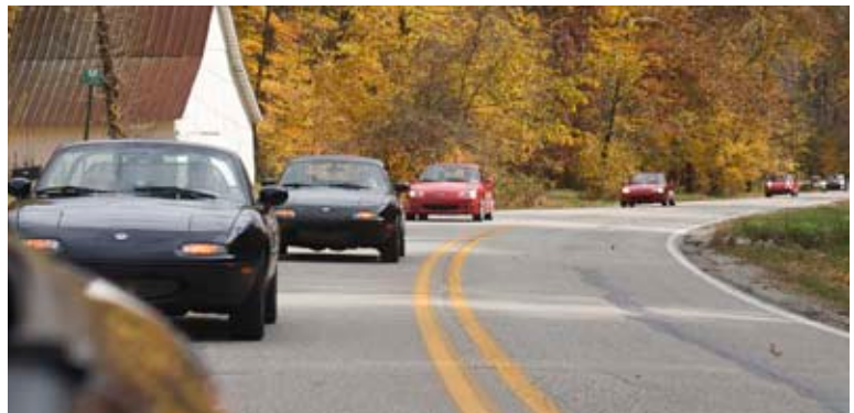
We drove great roads with great scenery all day.