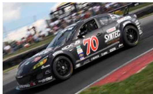
GT Class winner of 2010 "Rolex 24 At Daytona", the Speedsource Mazda RX-8. (seen here at Mid-Ohio, 2009.)