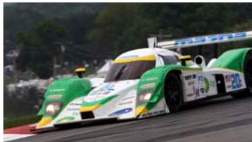
Mazda powered Lola Prototype of Dyson Racing - American Lemans Racing Series. (seen here at Mid-Ohio, 2009.)

The premiere class is Daytona Prototype, known as DP. These are special designed, single seat, closed, rear engine, sports cars. The Prototypes compete on the track with two classes of GT production based cars. This includes, Corvettes, Camaros, Mustangs, Porsches, and Mazda RX-8s (one driven by Patrick Dempsey of TV's "Grey's Anatomy"). I think the racing is very good and I hope some of you saw a little of this years race (it was on Speed TV). Maybe you will check it out in future races. They tested on the Indianapolis Motor Speedway road course last year. Look for an endurance race at IMS next year as part of the track's Centennial Celebration.