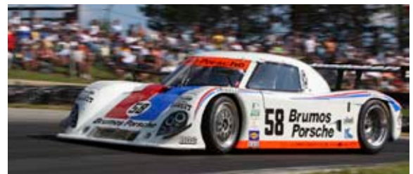
2009 Daytona 24 Hours winner, Brumos Racing Porsche/Riley (seen here at Mid-Ohio, 2009.) Zoom-Zoom to page 2